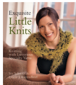
Exquisite Little Knits: Knitting with Luxurious Specialty Yarns