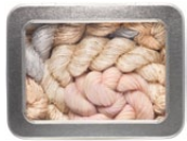
Mother of Pearl