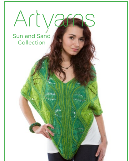
Sun and Sand Collection

The Silk Essence Collection features 5 beautiful patterns using our new Silk Essence Yarn. All patterns but one are 1 skein projects.