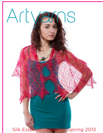
Silk Essence Collection Spring 2013

A follow-up collection to our popular Ensemble Light Collection vol.1 . Volume 2 contains four lace patterns that previously have only been released as Knit Alongs.