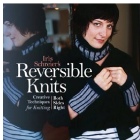
Reversible Knits: Creative Techniques for Knitting Both Sides