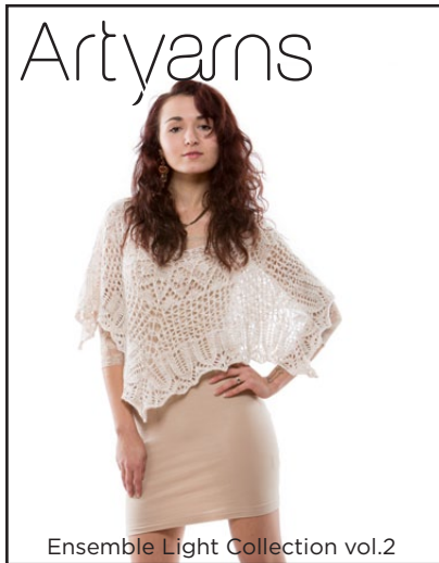
Ensemble Light Collection vol.2

A follow-up collection to our popular Ensemble Light Collection vol.1 . Volume 2 contains four lace patterns that previously have only been released as Knit Alongs.