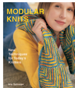
Modular Knits: New Techniques for Today’s Knitters